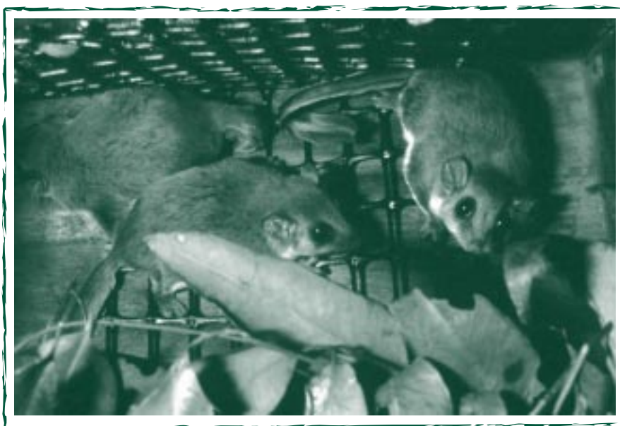
One nest box may be used by several species at different times. These feathertail gliders made use of bat boxes in south-east Queensland.

The inside diameter, entrance above the floor, height above the ground and placement should be considered when constructing and hanging a nest box. Entrance holes should be just large enough for the animal to enter. For more information about commercially available nest boxes search Australian internet sites for "nest boxes".