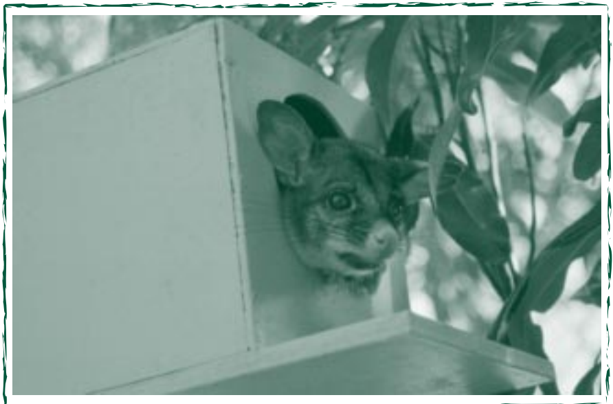
Possums regularly make use of nest boxes erected on the Douglas' Land for Wildlife property in south-east Queensland.

While artificial nest boxes have been a success overseas, it is only recently that they have used as a valid conservation tool in Australia. Nest boxes in the Herbert River Catchment in north Queensland are being used to encourage barking owls, barn owls and masked owls to breed. The objective is to reduce the use of baits to control sugar cane rats. Nest boxes have also been used in threatened species recovery programs in other parts of Australia, such as the red-tailed phascogale in Western Australia.